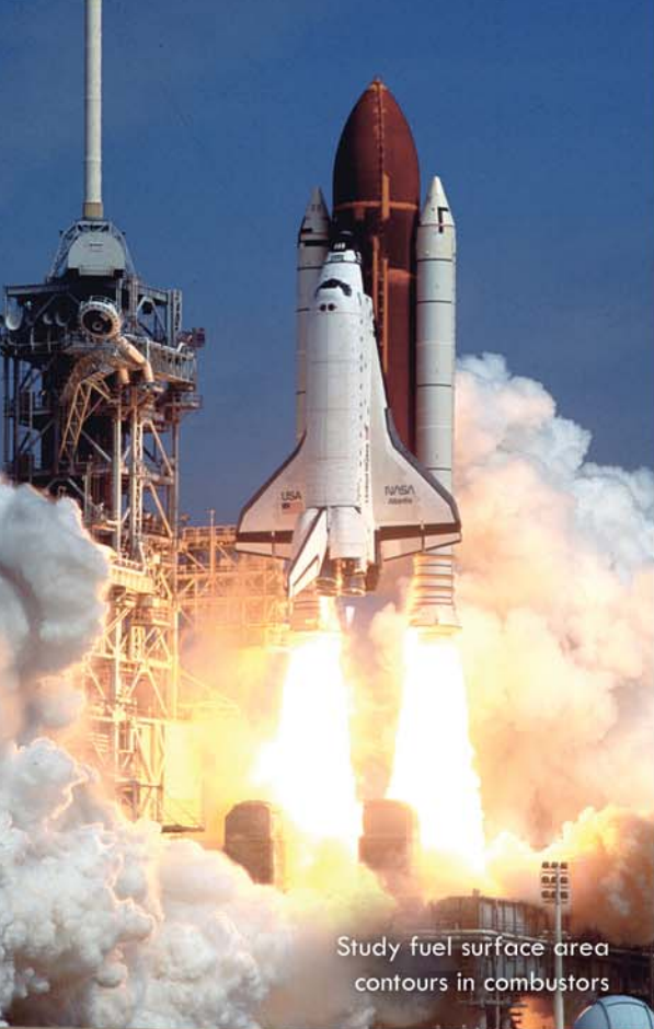
Study fuel surface area contours in combustors