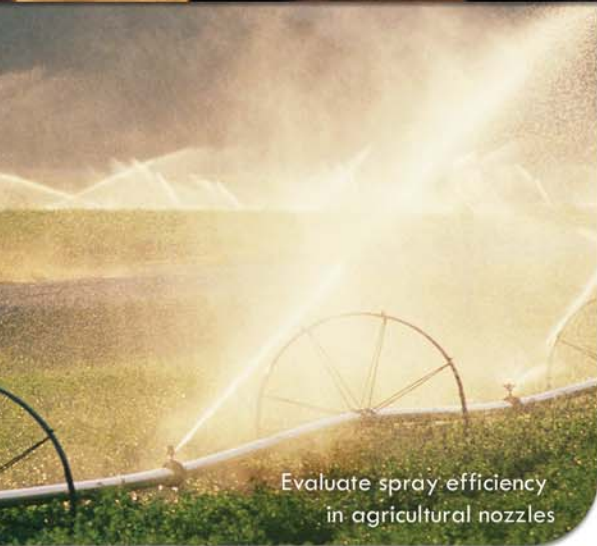
Evaluate spray efficiency in agricultural nozzles