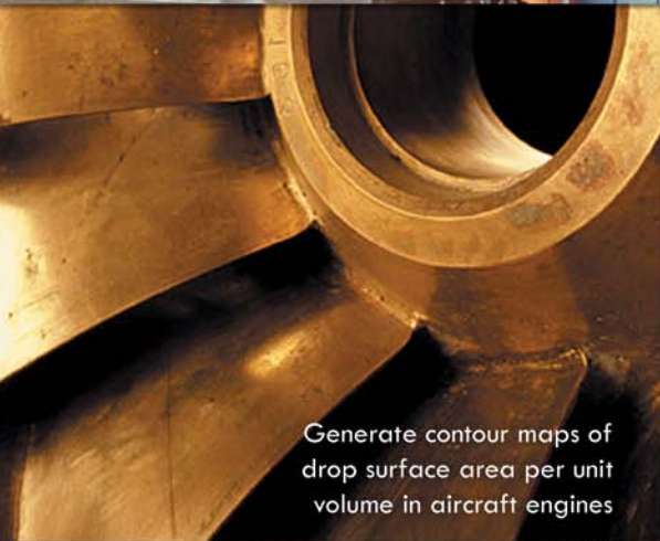
Generate contour maps of drop surface area per unit volume in aircraft engines